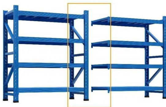
Main frame and sub frame share one column

The main frame has two columns frames, which can be used independently, Add on rack cannot be used alone, which must be used with the main rack.